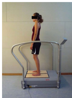
Figure 1 Starting position on stochastic resonance whole body vibration device.

The study was conducted at a University facility. The participants completed a single SR-WBV training session. A special device was applied for SR-WBV (©Zeptor med plus Noise, FreiSwiss AG, Zurich, Switzerland). Its key features were two independently and one-dimensional (up/down) stochastically oscillating floorboards, with two passive degrees of freedom (forward/backward and right/left). Each SR-WBV session was supervised, and the participants were instructed to stand in an upright position on the footboards with their arms hanging loose to the side and with slightly bent knees and hips (Figure 1). Both legs should have contact to the plates. It was permitted to change the knee angle but participants were instructed not to stand up straight because in that position vibration is conducted to the head. Figure 1